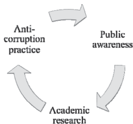
Figure 1: Development Cycle of Corruption as a Social Issue

The model of social maturity states can be used to explain the increasing interest in corruption as a research subject. Also, it helps to understand that trends in corruption research are embedded in the development of corruption as a social issue. This development is characterized by a continuous reinforcement of public awareness, academic research and anti-corruption practice (figure 1), driving the topic of corruption through the four states of social issue maturity.