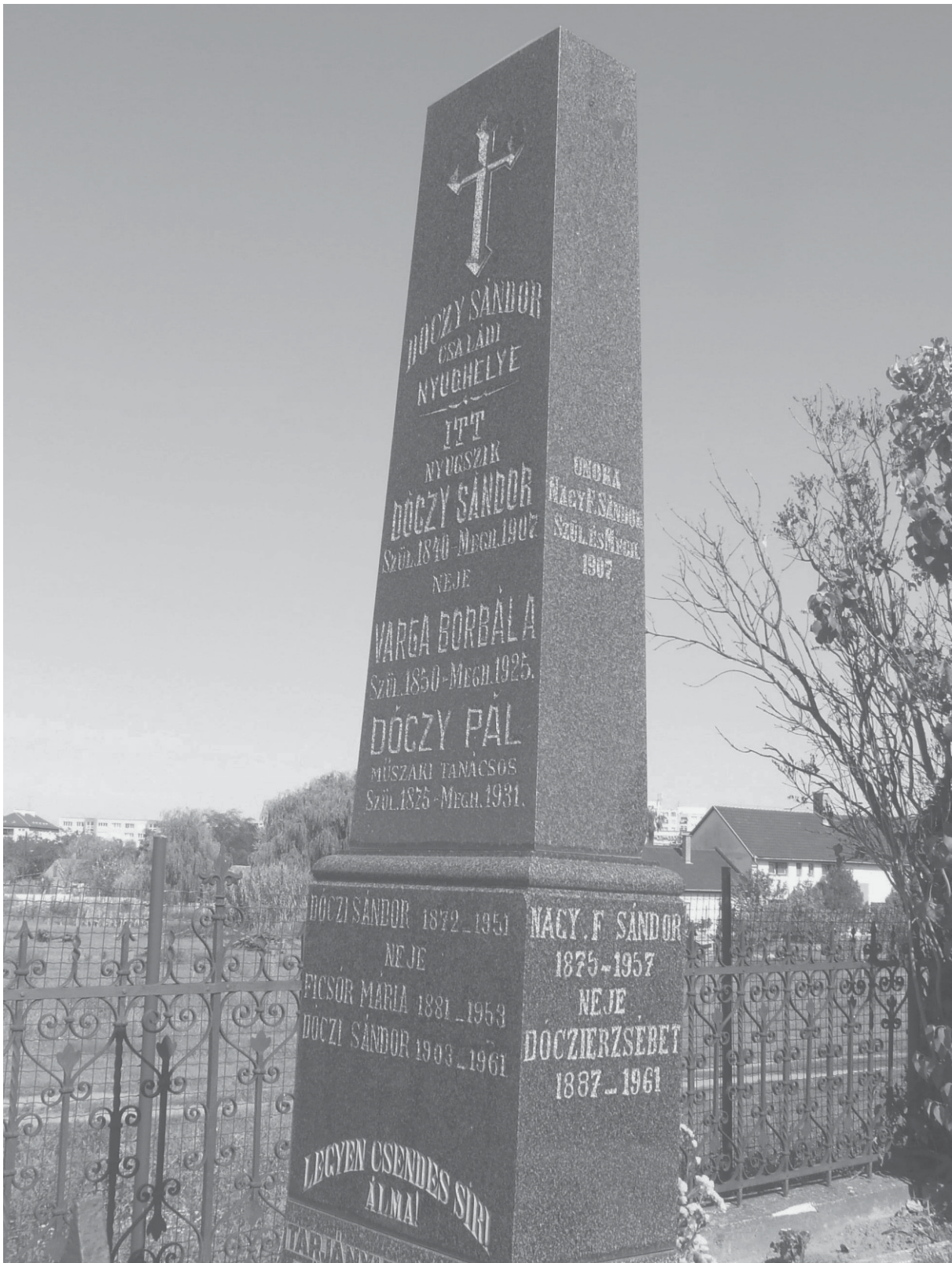
View of the Dóczy grave including the parents of our grandmother on the side (as repeated on the other stone, of our family branch)