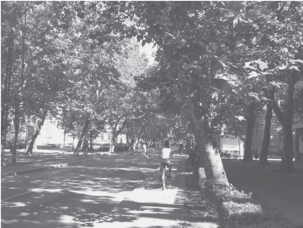
The street with platans in Kiskunfélegyháza, more than 100 years old