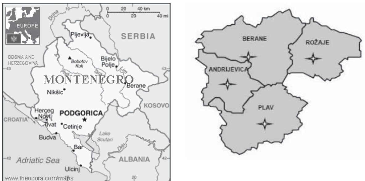
Figure 1 Location of Berane (Montenegro)

The Municipality of Berane on behalf of the four municipalities in the region asked the International Finance Corporation IFC, the “private arm” of the World Bank, as lead financial transaction advisor to assist in attracting a private partner to develop and operate the new sanitary landfill on the selected site, in compliance with EU directive on sanitary landfill and applicable local regulation.