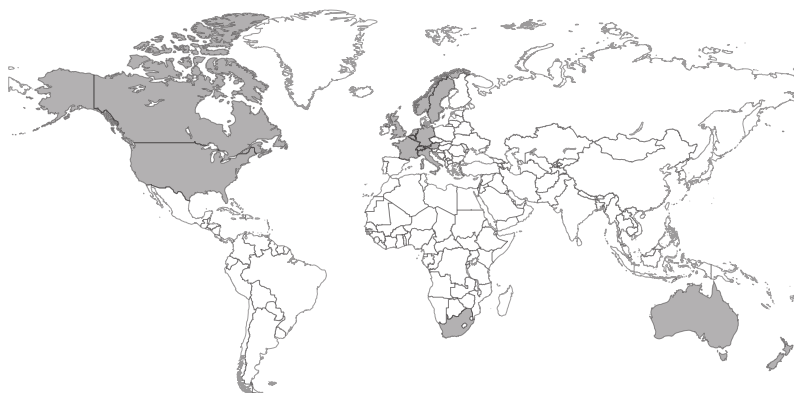
Figure 2.1: Location of the GCD member banks

data such as gross domestic product (GDP) and unemployment rates are included in the empirical analyses. For a detailed description of the explanatory variables, see Table A.1 in the Appendix.