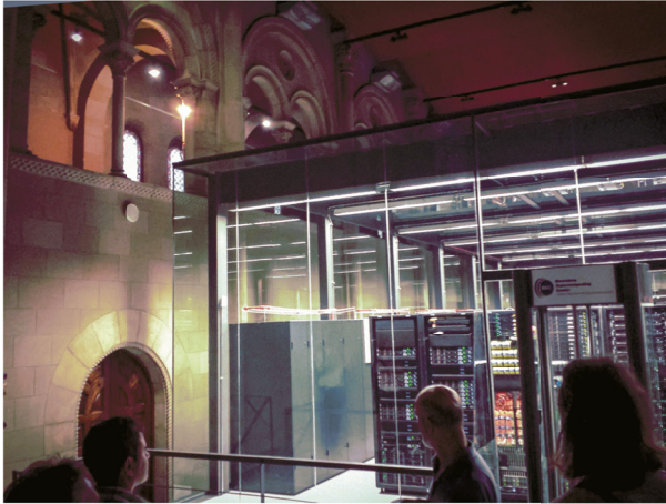
Figure 2.1.: Barcelona Supercomputing Center is constructed inside a former chapel

'A data centre could be defined as a structure, or group of structures, dedicated to the centralized accommodation, interconnection and operation of IT and network telecommunications equipment providing data storage, processing and transport services, together with all the support facilities for power supply and environmental control with the necessary levels of resilience and security required to provide the desired service availability' [160, p.430].