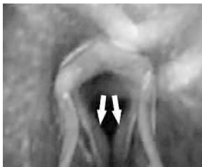
Fig. 2 Axial deviation of both caudal plicae vocales (ADPV, arrows) during inspiration. | Axiale Deviation beider kaudalen Plicae vocales (ADPV, Pfeile) während der Inspiration