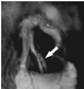
Fig. 1 Axial deviation of the right caudal plica vocalis (ADPV, arrow), in combination with a arytenoid collapse (ACC) on the left side. | Axiale Deviation der rechten kaudalen Plica vocalis (ADPV, Pfeil), hier in Kombination mit einem Aryknorpelkollaps (ACC) links

Obstructions were diagnosed also in the area of rima glottidis. This includes, arytenoid cartilage collapse (ACC), as well as findings in the area of the vocal folds, which can be summarised as vocal fold diseases (VFD). ACC was found in 11.2% (11/98) of horses. 6 of those horses showed a com-