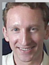
Benjamin Glick Snap Gene