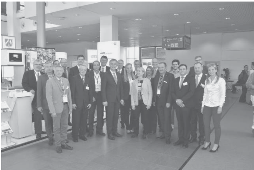
NRW community stand at the IFAT 2016