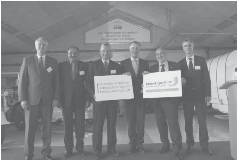
Kick-off event 2015