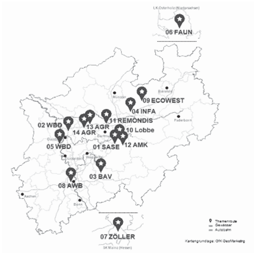
Figure 1 Themed route of circular economy